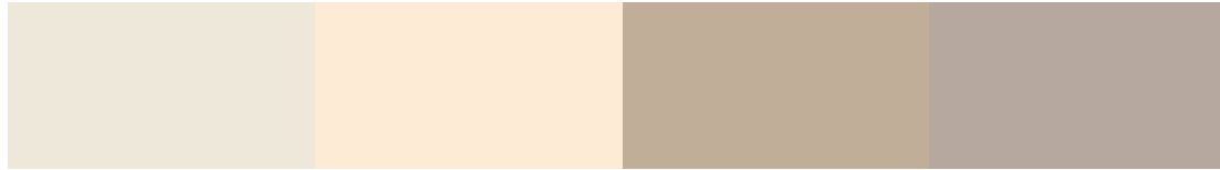
Pearl White Gloss (GA078A)